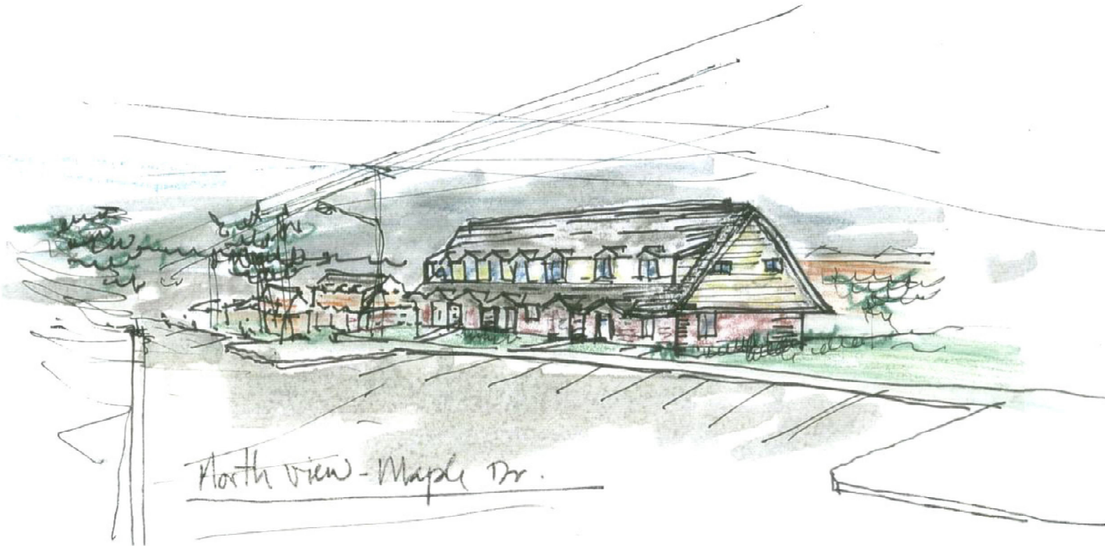
North view - Maple Dr.

New proposed sidewalk circulation (Relocated Away from Buildings)